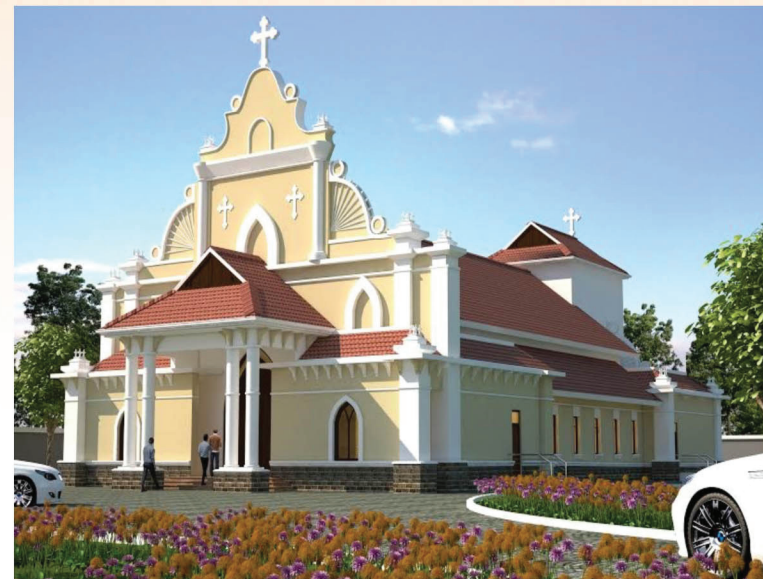
Chapel - The Hub of the Spiritual Center